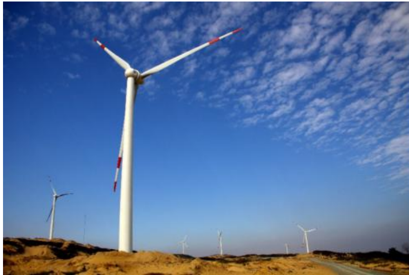
Jiangxi Branch offers financial supports for the Duchang Wind Farm project in Jiujiang

with the Principles, Guidelines and Standards of the Sustainable Financing Framework .