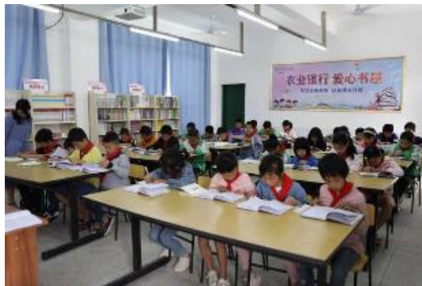
Hunan branch carries out the charitable activity to donate “ABC Library ” for Zaoshi Tower Central Primary School