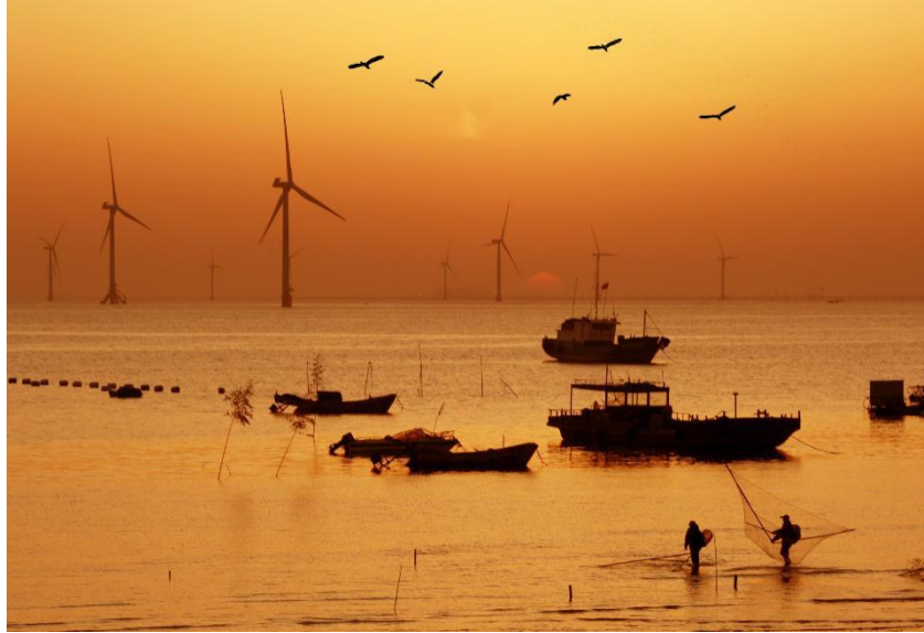
Jiangsu Branch supported the Longyuan Rudong Intertidal Wind Farm in Nantong