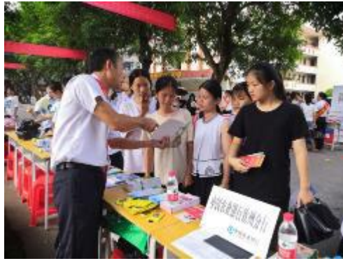
Employees of Qinzhou Branch, Guangxi explains financial knowledge to students.