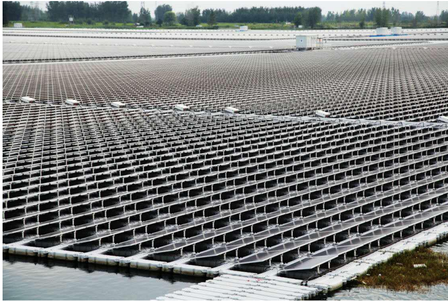
The floating solar power plant in Huainan, Anhui Province