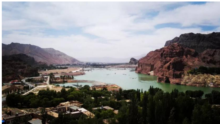
Qu Bay of the Yellow River, which flows through Xunhua County, in Qinghai Province

Located in the upper reaches of the Yellow River, Talatan, Gonghe County, Hainan Prefecture, has an average altitude of 2,920 meters and an average sunshine duration of 8 hours per day. Thanks to its unique landform and climate, it is the home to China's largest photovoltaic power generation project. The branch actively contacted customers and supported Qinghai Guangheng New Energy Co., Ltd. to construct the 20MW grid-connected photovoltaic power generation project through an internal syndicated loan as much as RMB 110 million.