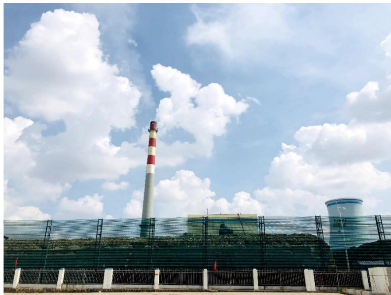
Jilin Branch provided credit support for biomass power generation project