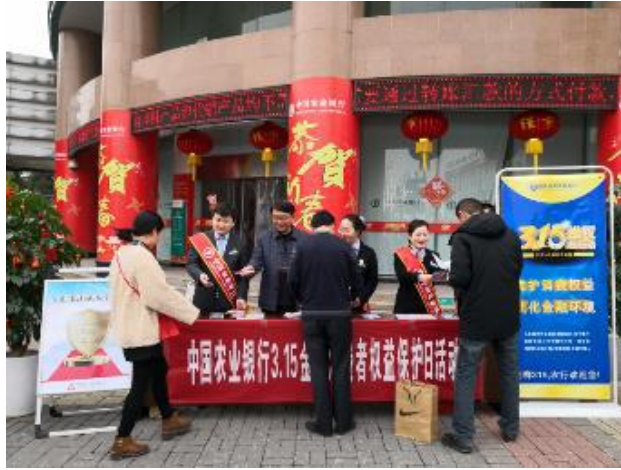
Chizhou Branch, Anhui launched 3.15 financial knowledge popularization