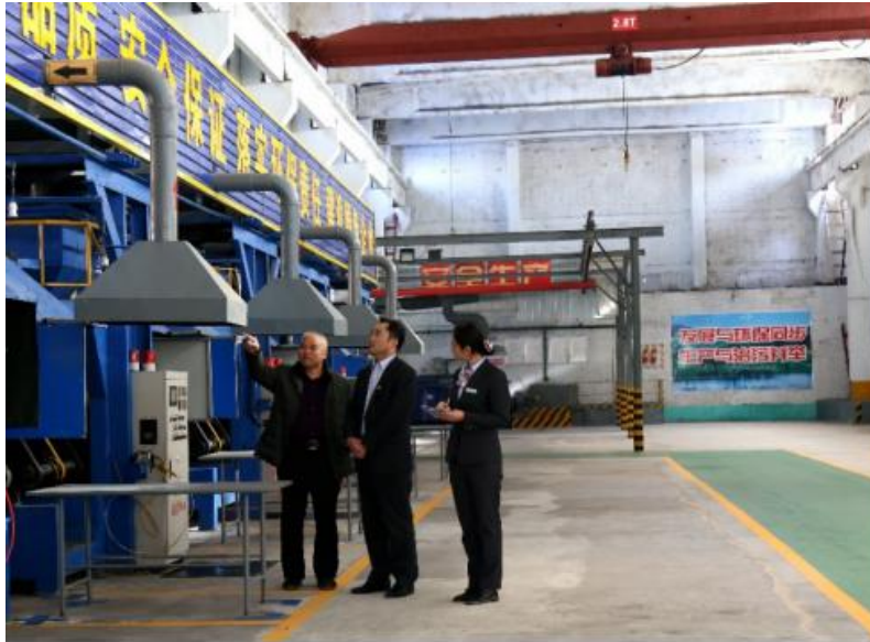
Shanxi Branch paid a visit to eco-friendly production facilities