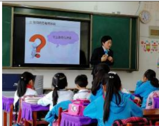
Guiyang Branch, Guizhou launched the activity of "Little bankers achieve great dreams" to help primary school students prevent telecommunication fraud