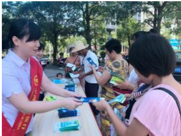
Quanzhou Branch, Fujian organized business backbones to visit the factory community and popularize financial knowledge for migrant workers