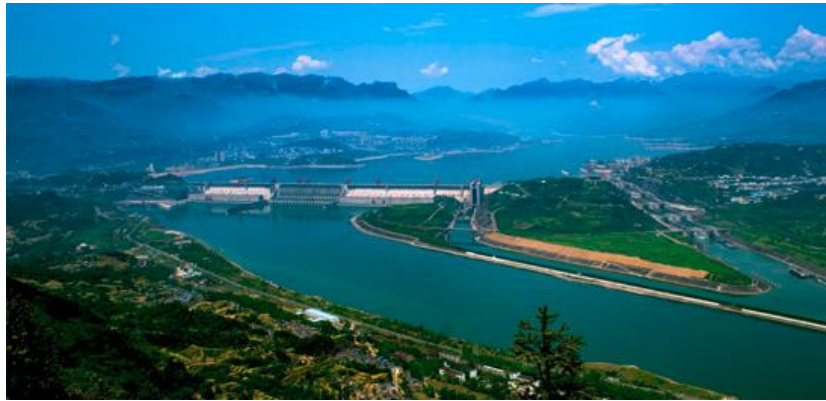
ABC and CTG work together to protect the Yangtze River

the Yangtze River, including Jiujiang, Wuhu, Yueyang, etc.