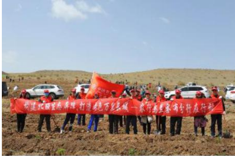
Ulanqab Branch, Inner Mongolia - Building the ecological shield along the north frontier, and constructing the green great wall