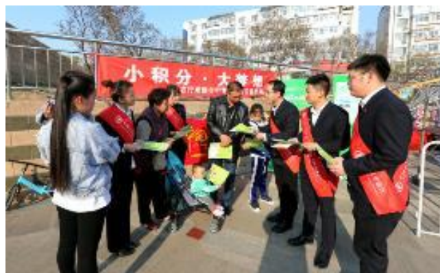
Chengde Branch, Hebei, launched "Small Bonus Points for Big