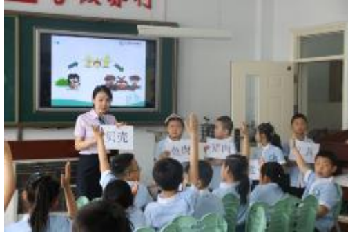
Jilin Branch's part-time financial instructors visited primary school to provide financial enlightenment training and teach the course of “origin of money”