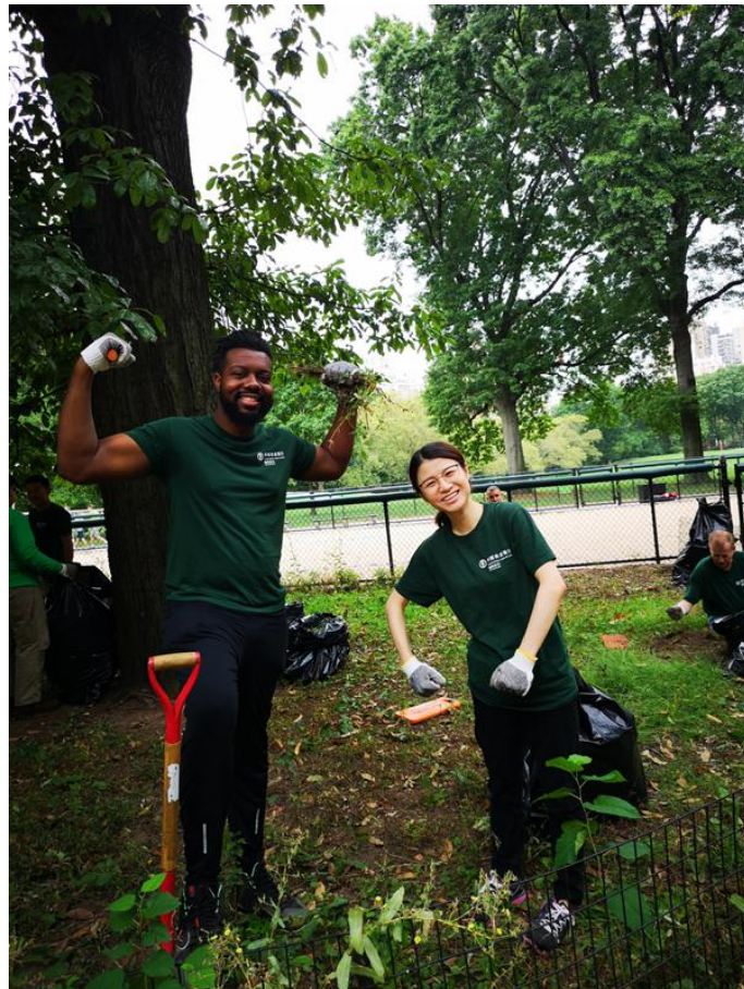
Employees of New York Branch took part in voluntary environmental activity in Central Park