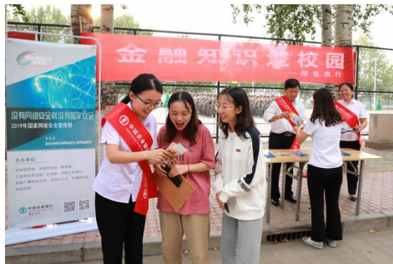
Xingtai Branch, Hebei conducted the activity of “popularizing financial knowledge in campuses”