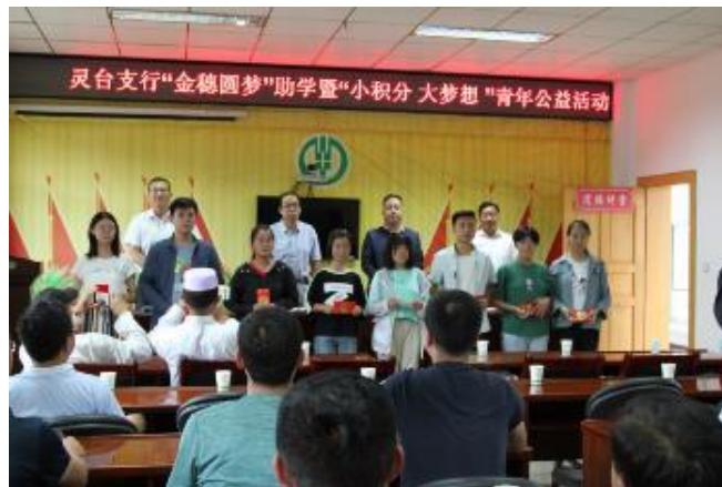
Lingtai County Sub-branch of Pingliang, Gansu, carried out the “Golden Dream” student subsidy program and Small Bonus Points for Big Dream activity.

Dream” activity to care for the healthy growth of left-behind children. The branch provided left-behind children in Siming Mountain Town of Yuyao City with stationery, supported the children's learning life and cared about their psychological growth through home visits, helping fill in the missing warmth of parents. Every Children's Day in June 1, volunteers take children out of Siming Mountain to experience life outside. In 2019, Ningbo Branch launched the campaign Micro-Donation to Spread Love through Books, and set up libraries in schools. With love and hope, the campaign strives to build a warm and beautiful world for children.