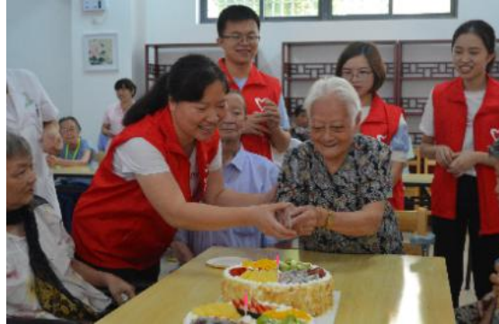
Xiamen Branch “ABC, Where Dreams Set Sail” Volunteer Team hosted a birthday party for the elderly

birthday parties, and provided volunteer haircut service to 2,580 senior citizens; a total of 1,430 volunteers had provided over 3,000 hours of service.